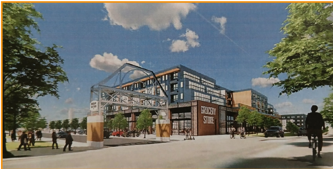
Proposed grocery store, parking structure and housing / office space on East Street to the North of the Amtrak Rensselaer Rail Station as well as on Amtrak's current surface parking lot.